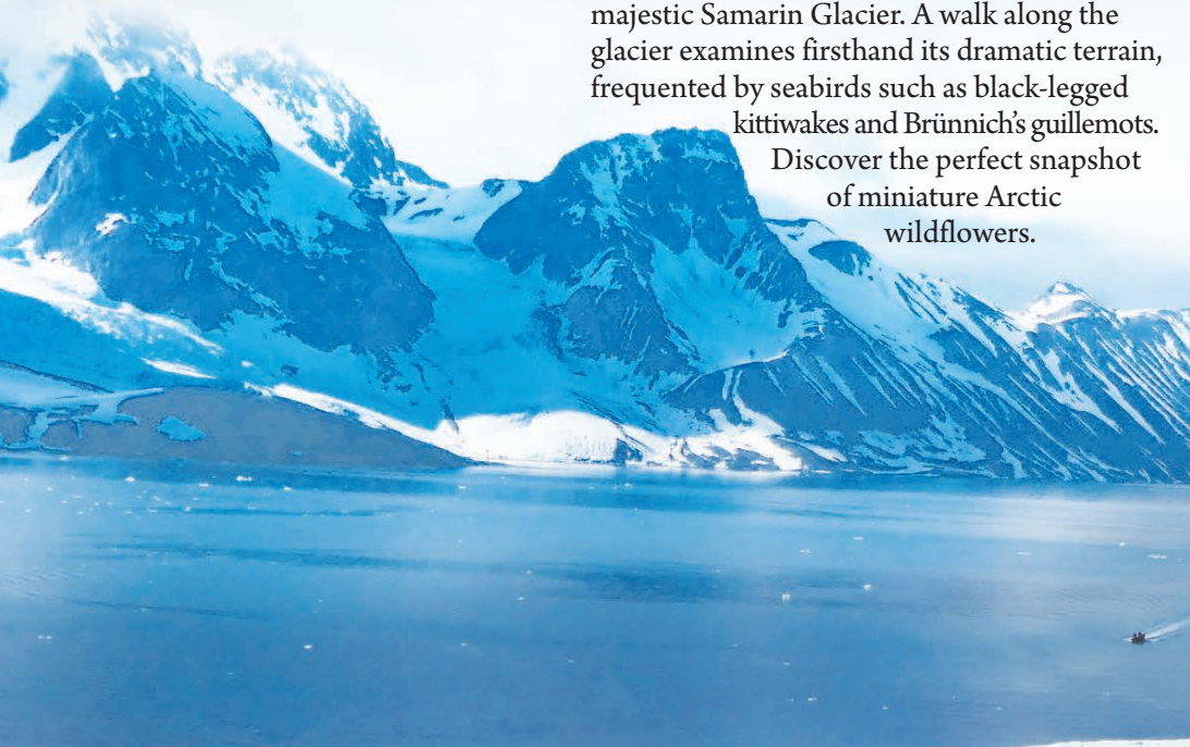
Photo this page: Join your expedition team on Zodiac excursions and guided Arctic walks.

Discover the perfect snapshot of miniature Arctic wildflowers.