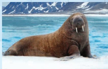
Walruses, "Arctic Giants," weigh up to 1.5 tons.