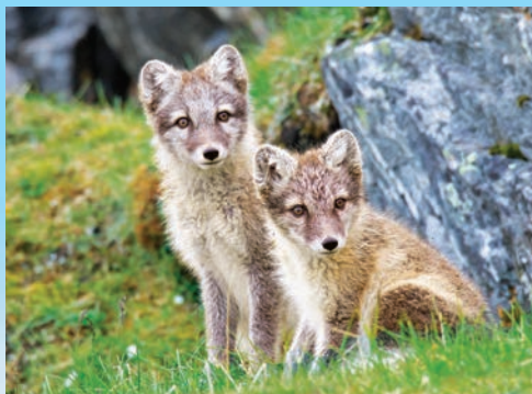
Native to the Arctic tundra biome, Arctic foxes use their acute hearing to locate prey precisely.