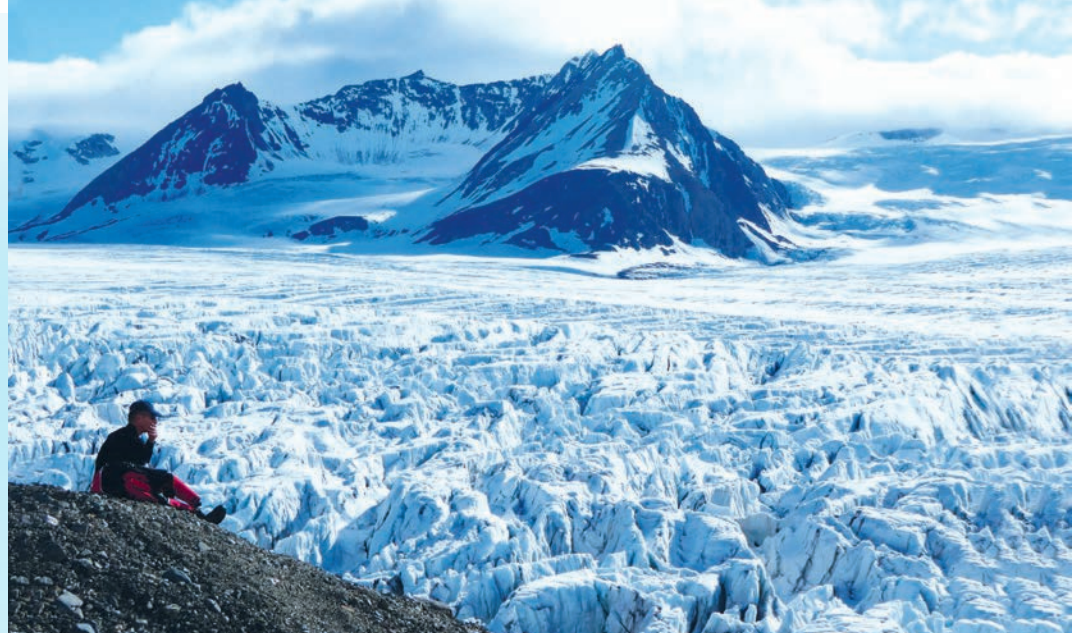
Be among the few to view expansive, breathtaking Arctic ice, the oldest of which appears the darkest blue.

Keep a keen eye out for these ivory-furred creatures and scan the cobalt-blue waters for bowhead and beluga whales, often spotted swimming in pods.