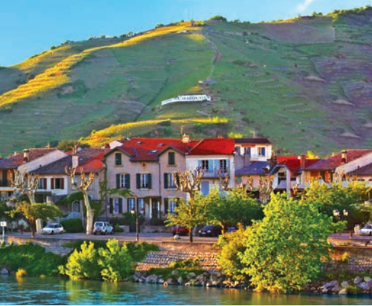
ides of the river, producing some of the world's most

views of the ornate 19 th -century Basilique Notre-Dame-de-Fourvière. Walk the tree-lined streets of the restored Vieux (Old) Lyon, where well-preserved Gothic and Renaissance mansions attest to the wealth of Lyon's long-standing silk industry.