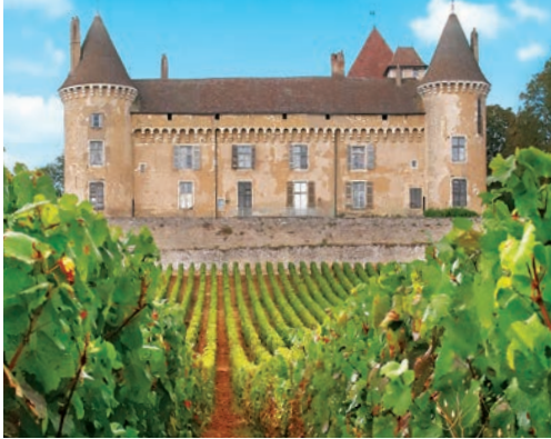
Tour Château de Rully, a medieval fortress in the wine region of Burgundy.