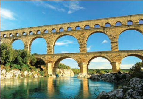
The first-century Pont du Gard aqueduct was built with 55,550 tons of soft limestone blocks.

Beaune, founded in the fifth century B.C., is the longtime capital of Burgundy wines, located in the famous Côte d'Or département .