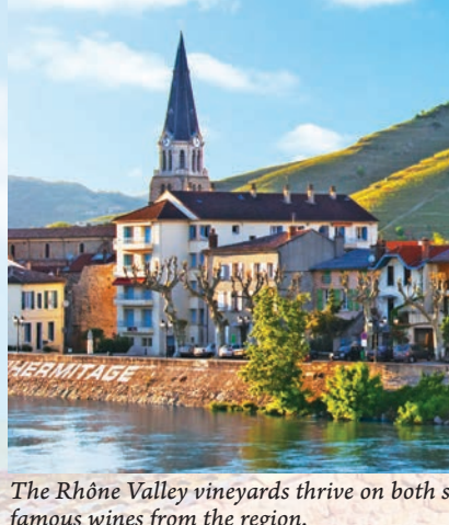
The Rhône Valley vineyards thrive on both of the region's famous wines from the region.

Gothic era and the primary testament to Avignon's golden age.