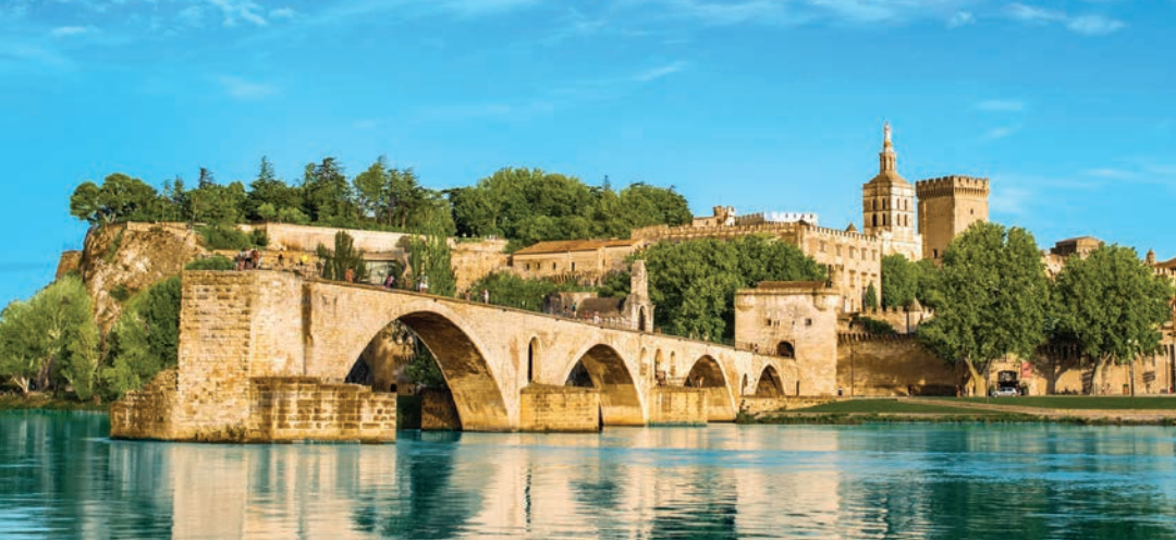
The 12 th -century Saint Bénézet was said to have been endowed with the strength to lay the stones of the Pont d'Avignon in the Rhône River with his own hands.

From the lovely vineyards of Beaujolais, the "land of the golden stones," France's youthful, fruity nouveau wines are cultivated. Located along the banks of the Saône River,