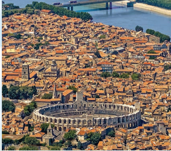
Arles' Romanesque architecture reflects its history as a vital port on the Roman road from Italy to Spain.

views of the ornate 19 th -century Basilique Notre-Dame-de-Fourvière. Walk the tree-lined streets of the restored Vieux (Old) Lyon, where well-preserved Gothic and Renaissance mansions attest to the wealth of Lyon's long-standing silk industry.