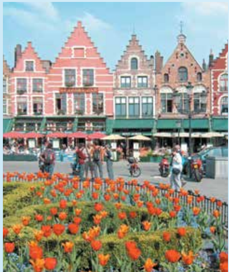
The lively, medieval Markt is the principal city square and gathering point in Bruges.

The Hoofdtoren Tower on Hoorn Harbor dates back to the 16 th -century and is one of the city's last preserved fortifications.