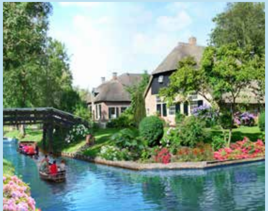
Cover photo: Cruise through Holland, where tulip blooms announce the arrival of spring.