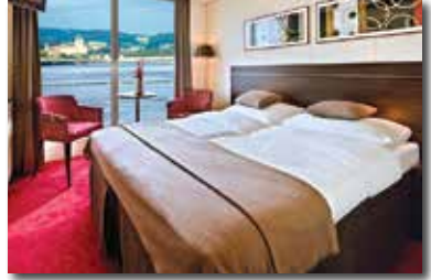
Stateroom Category 2

The English-speaking, international crew provides warm hospitality. The ship meets the highest safety standards and is one of the only European river ships to have been awarded the "Green Certificate" of environmental preservation.