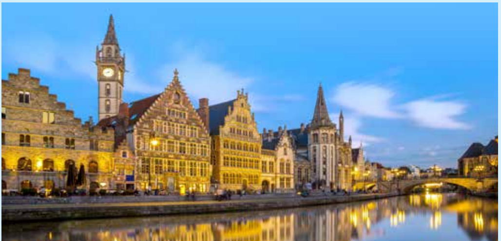
Located on the Leie River, Ghent's spectacular medieval harbor, Graslei, is celebrated for the intricate and beautifully preserved façades of its historic guildhalls and is now a protected cityscape.

With four miles of canals and over 150 bridges, the beautiful town of Giethoorn is affectionately known as the "Venice of the Netherlands."