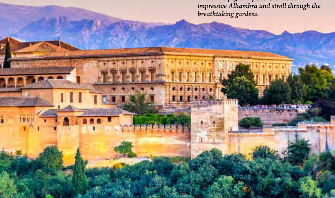
Photo this page: Explore Granada's impressive Alhambra and stroll through the breathtaking gardens.

Cover photo: Stroll over the colorful, storied bridges in Seville's Plaza de España.