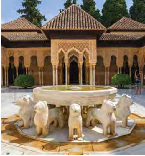
Tour the Court of the Lions, the main courtyard of the Nasrid dynasty Palace of the Lions, in the heart of the Alhambra.