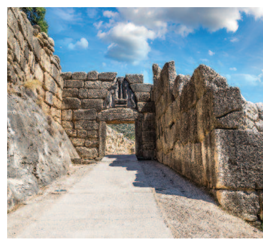
The Lion Gate in Mycenae, Peloponnese, Greece