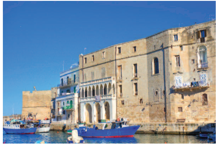
Monopoli, Puglia, Italy