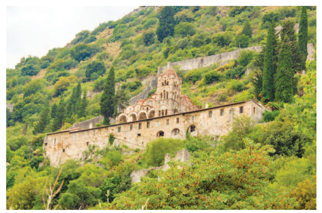
Mistra, Peloponnese, Greece

warehouse, whose exhibits chronicle how olive oil was made from antiquity to the present. Overnight at the lovely new Mystras Palace Resort and Spa, located in the countryside near Sparta.