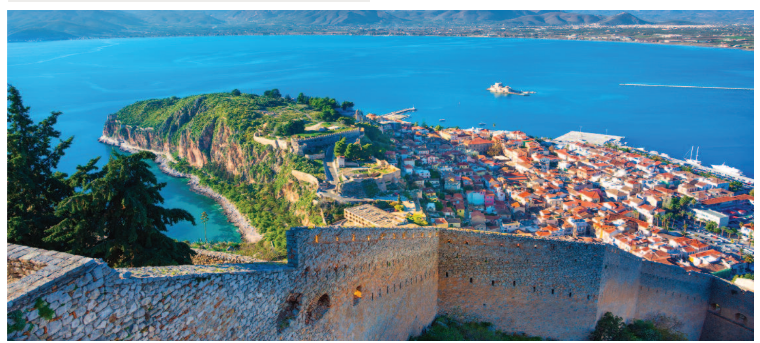
Nafplion, Peloponnese, Greece