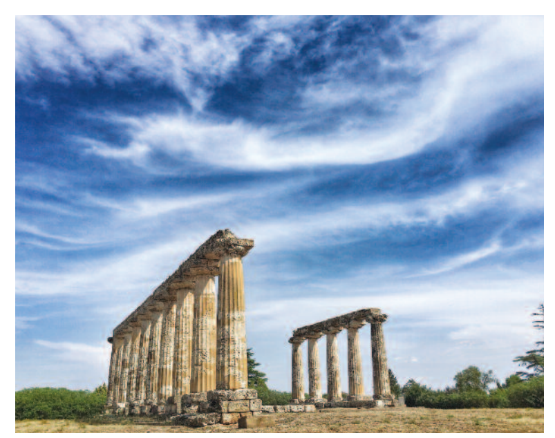
Tavole Palatine, Metapontum, Puglia, Italy

Thalassa Journeys was established by the principals and managers of Travel Dynamics, the company that 50 years ago pioneered the concept of educational travel for America's educational and cultural institutions. The belief that travel is primarily a learning experience forms the core principle of Thalassa Journeys. We bring an unrivaled depth of experience to make your journey with us meaningful, unique and seamless. We will take you not only to marvelous places, but we will also bridge the past with the present, illuminate the ancient sites we explore – what they were, how they came to be, and why they matter to us – make them come alive, and enrich your mind and inspire your senses. We are steeped in the culture of our destinations and know the secret places often overlooked by the guidebooks. We welcome you to the ever fascinating world of Thalassa Journeys.