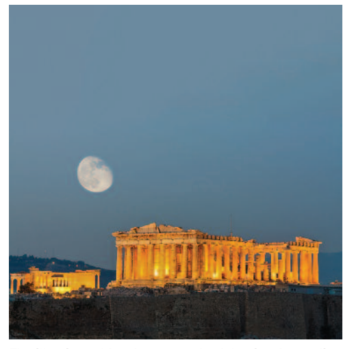
The illuminated Parthenon on the Athenian Acropolis

Drive through the heartland of the Peloponnese to Mistra. Built on a conical hill that commands superlative views of the plain of ancient and modern Sparta, Mistra was one of the last flourishing centers of the Byzantine Empire. Today, it is an evocative medieval walled city, with several churches that contain luminous frescoes, palaces and houses from that period. Perhaps no other place in Greece gives travelers such a complete picture of the medieval period as Mistra does, now a UNESCO World Heritage Site. After lunch, visit Sparta's Museum of the Olive, housed in a restored olive