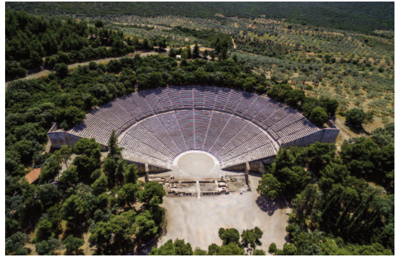
The 4th-century BC theater of Epidaurus, Peloponnese, Greece